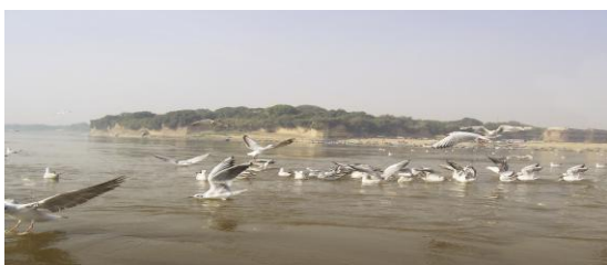
A view of Sangam

We, the family members of Nehru Gram Bharati University, warmly welcome you to the religious Sangam city of Allahabad in the Conference. We assure you of good science, comfortable stay and, above all, our humble hospitality to enrich you with memorable experience.